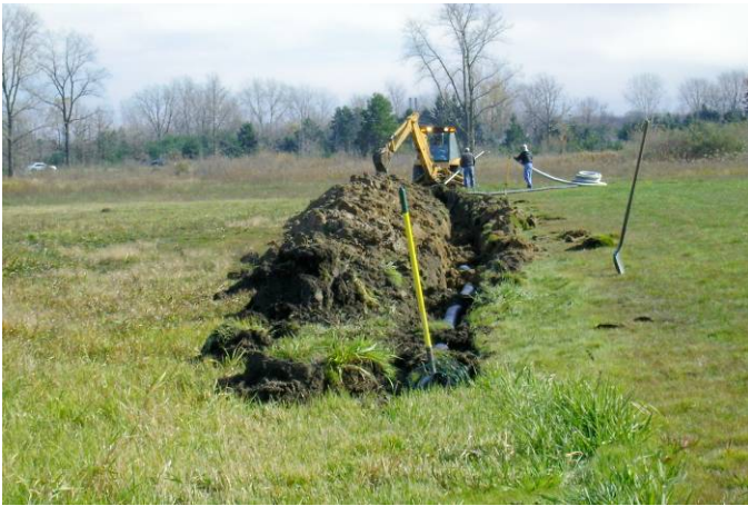
Trenching and laying the drainage tubing.